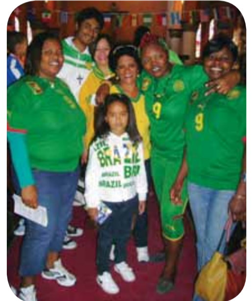
Top: Cameroonian, Brazilian and South African supporters at Mass on Soccer Sunday