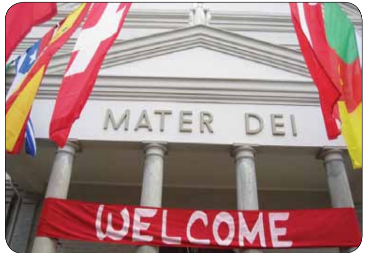
TOP: The flags in front of Mater Dei