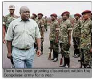
There has been growing discontent within the Congolese army for a year.

Eyewitnesses said they had heard gunfire for about an hour around the president's hilltop home in Kinshasa, known as the Marble Palace and