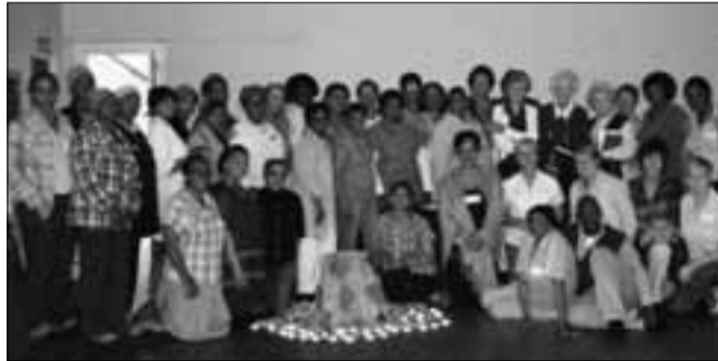
Spiritual Retreat 19th November 2011

Feedback given from the volunteers included such comments as "I experienced so many things, I say thank you to the Lord for making me a part of this retreat", "the bible and God's word revived me because God loves us all and we are created by Him". These retreat experiences provide much needed stress relief and spiritual nourishment that sustain the Care Ministry volunteer care givers in their work within the communities.