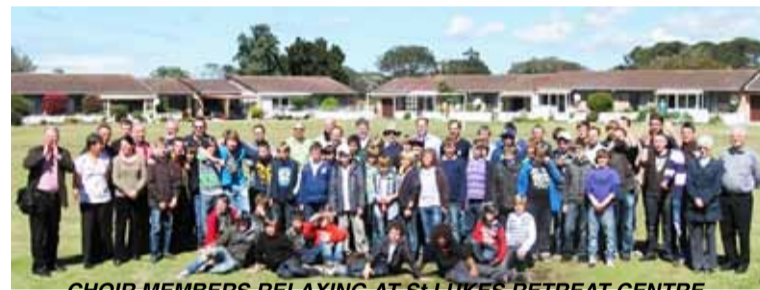
CHOIR MEMBERS RELAXING AT ST LUKES RETREAT CENTRE.

On Friday the 15 th October the St Augustine's Cathedral in Port Elizabeth was packed to capacity for the Aachen Cathedral Choir in Concert from Germany.